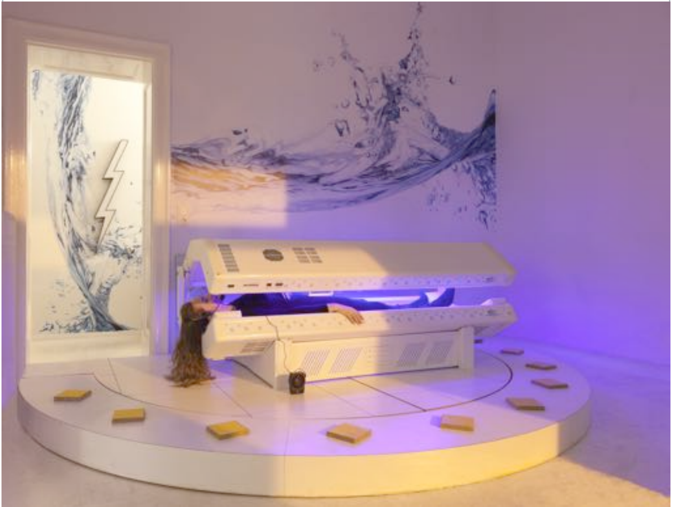
Space 1: Solarium