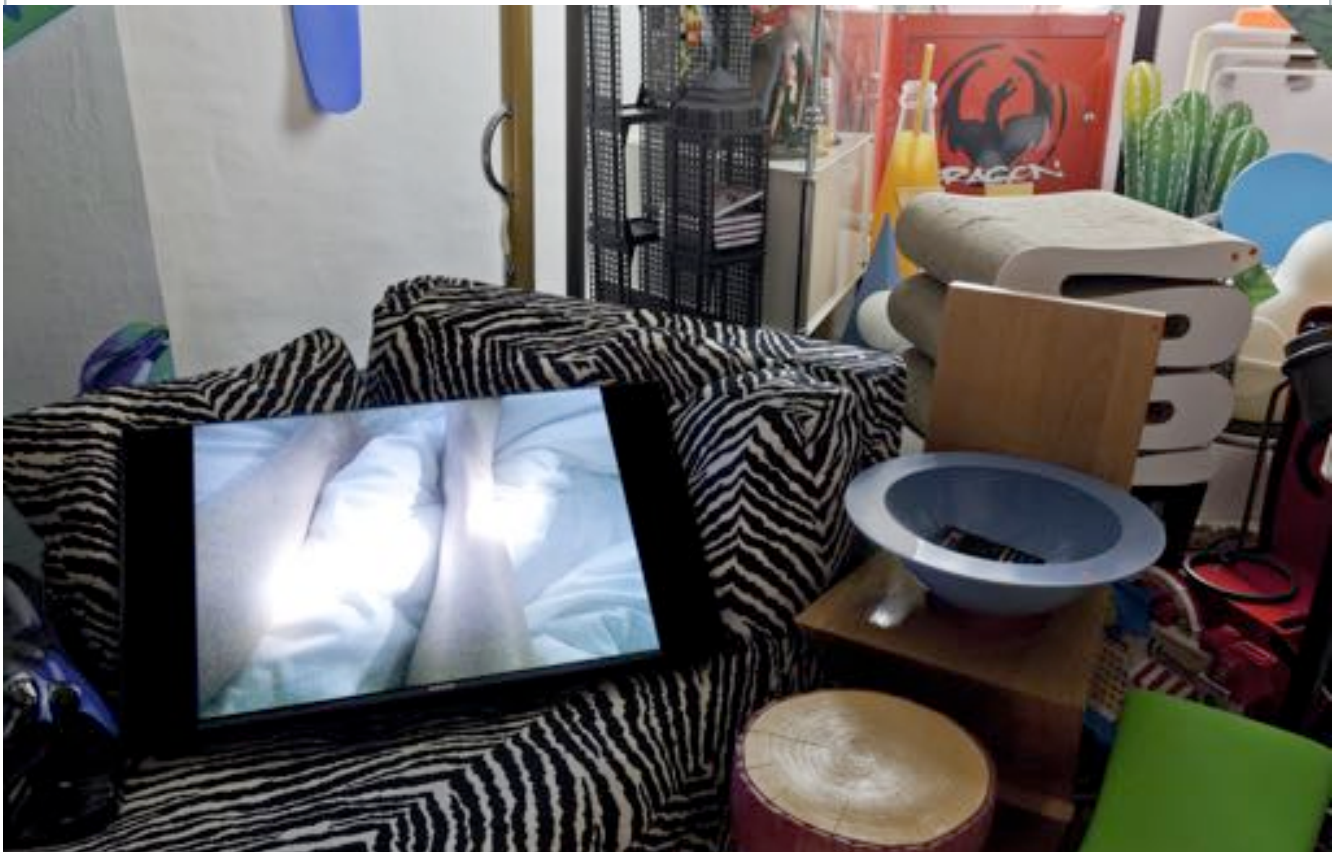
Space 2: Installation 80's design plus video-still + ticking clocks