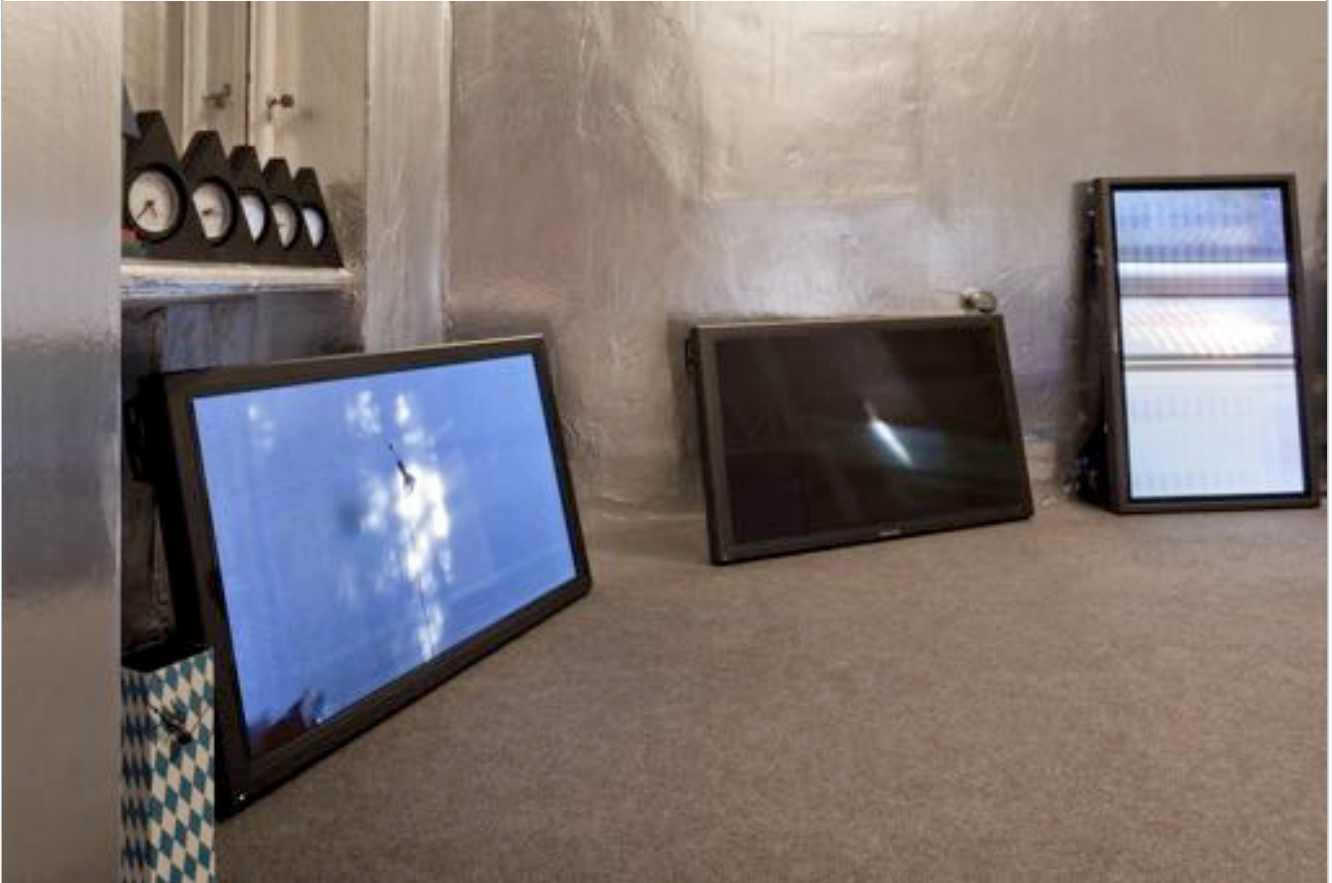
Space 3: 5 plasma-screens with 1 minute video's of Sun-Penetrations