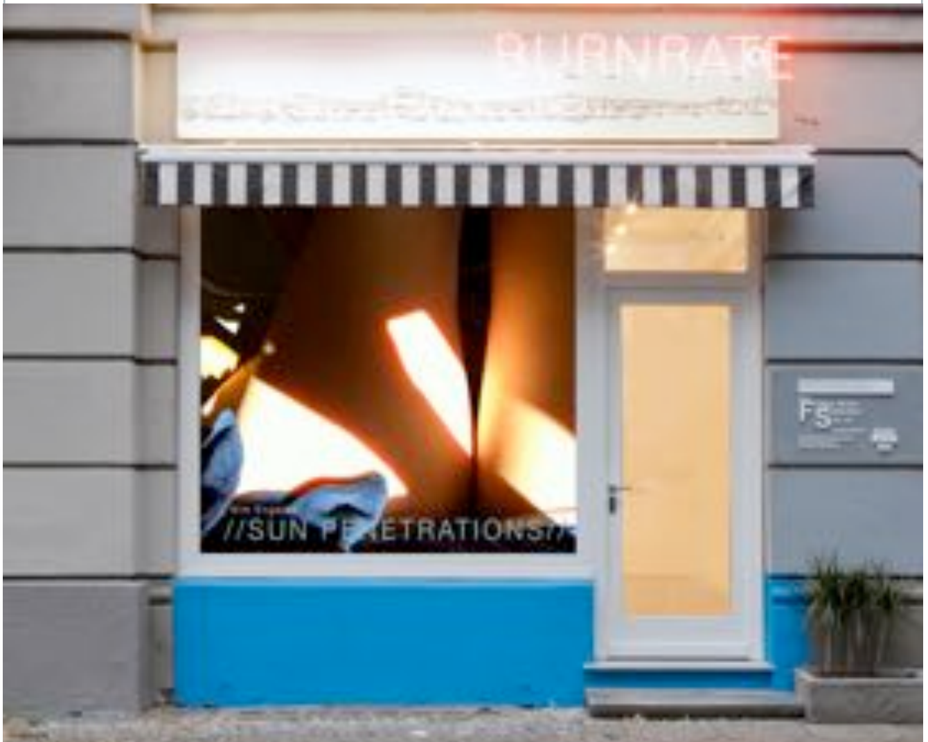
Outside view of Burnrate with flag of the [Sun-Penetrations] in the window