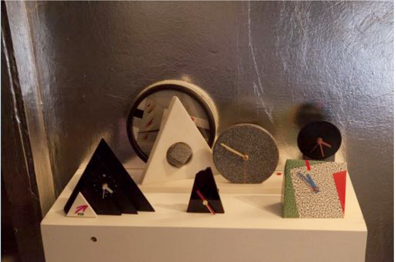
Space 3: More ticking clocks!